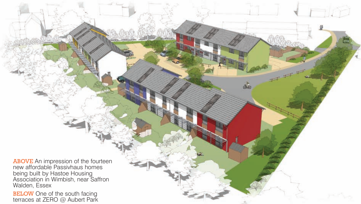
ABOVE An impression of the fourteen new affordable Passivhaus homes being built by Hastoe Housing Association in Wimbish, near Saffron Walden, Essex

A development which proves the upmarket potential of Passivehaus is ZERO @ Aubert Park in Highbury, north London. Here a terrace of four 3142 sq ft town houses is awaiting Passivhaus Certification. Priced at £2,500,000, each has a double height living cube, four double bedrooms with en-suites, a cinema room, a games room and two roof terraces. The project is a collaboration